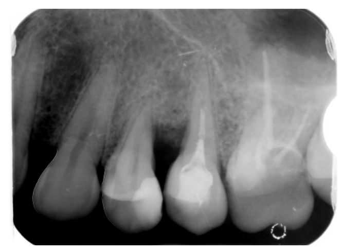
Figure 9. Periapical radiography two weeks after surgery