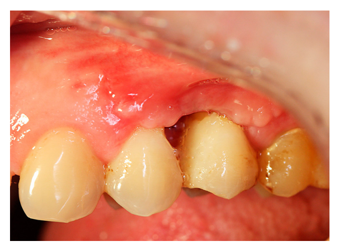
Figure 8. Clinical presentation two weeks after surgery

Due to personal reasons, the patient came for a followup appointment two-weeks after the surgical procedure. Intra-oral examination revealed no bone exposure in the buccal and interproximal area of teeth 24–25; however, soft tissue was not completely healed (Fig. 8). Fibrin exudate and granulation tissue were still visible. The interproximal area of the 24–25 was characterized by a noticeable soft tissue and hard tissue loss in the vertical dimension. The periapical radiography showed a loss of interproximal bone