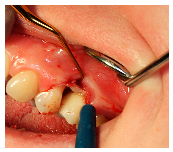
Figure 3. Necrotic buccal bone plate with demarcation line

Periapical radiography showed a subtle demarcation line in the alveolar bone and a temporary filling in the root of the tooth 25 (Fig. 2). No radiolucency was detected in the apical region of the upper left premolars. Exploration of the buccal aspect of alveolar bone with a periodontal probe revealed the demarcation line (Fig. 3). The exposed bone was greyish and sensitive with no bleeding on probing. Flap surgery was scheduled for the next day, and the patient received clindamycin (Dalacin C Pfizer, Belgium) 0.3 g every six hours for six days. The patient was also advised to discontinue, or at least drastically reduce cigarette smoking. Due to the difficult-to-heal wound associated with bone sequestration in the region of the upper left premolars, PRF was planned to be applied during the flap surgical procedure.