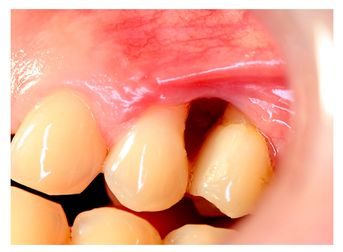
Figure 10. One month after surgery. Vestibule Has become considerably shallower. Absence of the interproximal dental papilla between teeth 24–25

The patient did not appear at the Department of Periodontology and Oral Mucosal Diseases for the subsequent follow-up visits. She finally came three years after the surgery.