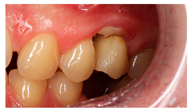
Figure 1. Gingival and bone necrosis at the site of teeth 24–25 on the day of the first appointment

A month after placement of devitalizing agent, the patient presented herself at the Department of Periodontology and Oral Mucosal Diseases of the Medical University in Lodz. Intra-oral examination revealed papilla in the interproximal area of teeth 24–25 and attached gingiva loss on the buccal surface of the tooth 25. The ridge of the buccal aspect of alveolar bone crest was exposed and an interproximal alveolar bone crater was visible in the region of teeth 24–25 (Fig. 1).