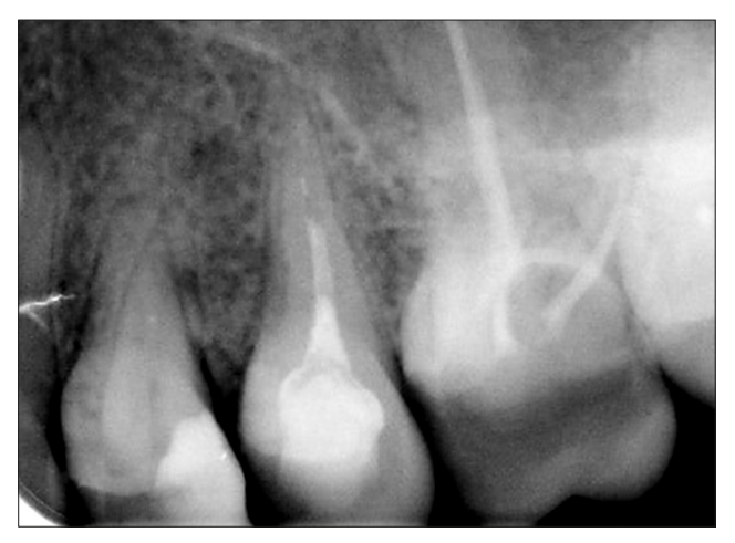
Figure 2. Periapical radiography made during the patient's first appointment

Periapical radiography showed a subtle demarcation line in the alveolar bone and a temporary filling in the root of the tooth 25 (Fig. 2). No radiolucency was detected in the apical region of the upper left premolars. Exploration of the buccal aspect of alveolar bone with a periodontal probe revealed the demarcation line (Fig. 3). The exposed bone was greyish and sensitive with no bleeding on probing. Flap surgery was scheduled for the next day, and the patient received clindamycin (Dalacin C Pfizer, Belgium) 0.3 g every six hours for six days. The patient was also advised to discontinue, or at least drastically reduce cigarette smoking. Due to the difficult-to-heal wound associated with bone sequestration in the region of the upper left premolars, PRF was planned to be applied during the flap surgical procedure.