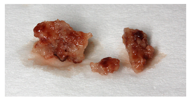
Figure 5. Excavated necrotic bone