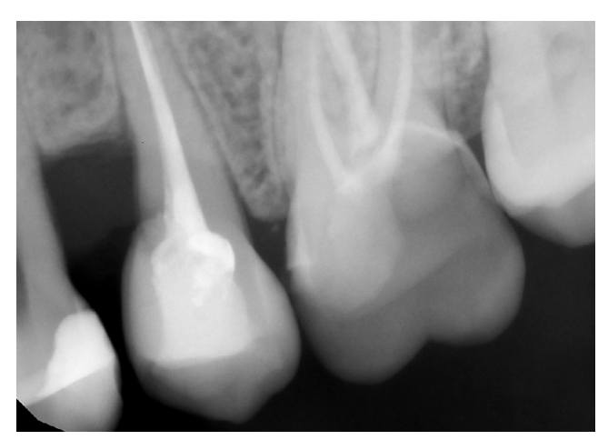
Figure 12. Periapical radiography made 3 years after surgery

The patient has not reported any discomfort in the treated area. Both upper left premolars were preserved, and tooth 24 was vital. Clinical examination showed the absence of buccal aspect of the interdental papilla between teeth 24-25 and exposure of cementoenamel junction in this area (Fig. 11), but no increased probing depth or bleeding on probing was detected. In comparison to the clinical situation two weeks postoperative, a band of attached gingiva and vestibule depth were reconstructed. The periapical radiography of the operated area showed horizontal bone loss, but the bone was well-mineralized with clearly visible lamina dura (Fig. 12). The contact point between the upper left premolars was lacking. Despite a tissue defect in the interproximal area of teeth 24-25, the patient was satisfied with the treatment results and did not wish to undergo any further mucogingival surgery or prosthetic treatment to reconstruct the interproximal contact point in the region of the teeth.